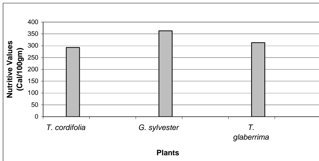
Fig. 3- Evaluation of Nutrient Value

Potassium was higher in all studied medicinal plants but they contained less sodium; Na and K. take part in ionic balance of the human body and maintain tissue excitability, carry normal muscle contraction, help in formation of gastric juice in stomach [34], K help in release of chemicals which acts as nerve impulses, regulate heart rhythms, deficiency causes nervous irritability mental disorientation, low blood sugar, insomnia and coma [35]. Iron sufficient in all studied medicinal plants, it make body tendons and ligaments, certain chemicals of brain are controlled by presence or absence of Iron, it is essential for formation of hemoglobin, carry oxygen around the body [36] Iron deficiency causes anemia, weakness, depression, poor