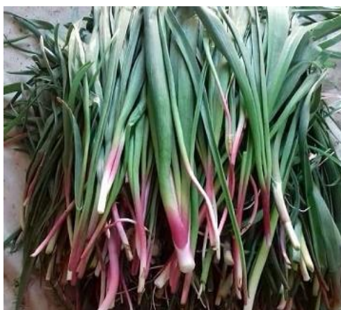
Fig. 1. Allium jesdianum

One of the remarkable species within the Allium genus is Allium jesdianum Boiss. & Buhse, locally named Bowser, Sarpa, or Bon-Sorkh in different cities of Iran due to the red color of its onion. A. jesdianum found in Middle East regions, growing wild at altitudes of 1800-2600 meters in the western region of Iran. It is an herbaceous, perennial plant that grows from a bulbous rootstock. It produces a cluster of grass-like leaves, and a flowering scape that reaches a height of around 75-90cm (Figure 1).