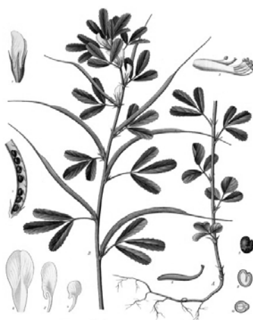
Fig. 2- Fenugreek ( Trigonella foenum-graecum L.) from source of Koehler's Medicinal Plants images [35]

provide a reliable basis to predict the performance of their progenies for a higher diosgenin content of seed, from very early generations [15, 18, 29].