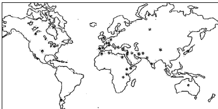
Figure 1- Fenugreek cultivation throughout the world [26]

Different authors have widely divergent opinions about the probable ancestry of T. foenum-graecum . Vavilov [27] has suggested that fenugreek is native to the Mediterranean region, while De Candolle [28] and Fazli and Hardman [2] proposed an Asian origin for the crop [26]. De Candolle [28] and Fazli and Hardman [2] notice that fenugreek grows wild in Punjab and Kashmir, in the deserts of Mesopotamia and Persia, in Asia Minor and in some countries in Southern Europe such as Greece, Italy and Spain. De Candolle [28] believes that the origin of fenugreek should be Asia rather than Southern Europe, because if a plant of fenugreek nature was indigenous in Southern Europe it would be far more common and not be missing in the insular floras of Sicily, Ischia and the Balearic Isles [15].