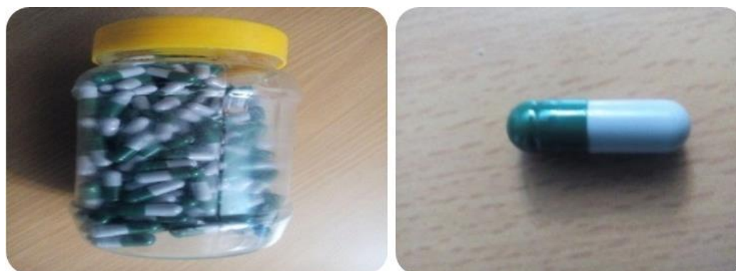
Fig. 4. Herbal capsule