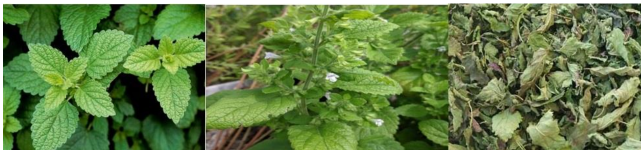
Fig. 3. Melissa officinalis plant