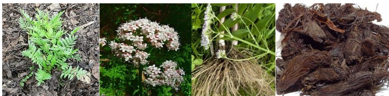
Fig. 2. Valeriana jatamansi plant

and causes the liquid to dry quickly and turn it into a solid powder. The extraction of two plants was done separately but with the same recipe. The extract powder was poured into 500 mg capsules by a capsule filling machine (Manual capsule filling machine made in Iran, for 500 mg capsules). Each capsule contained 200 mg of V. jatamansi extract, 80 mg of M. officinalis extract and some maltodextrin as a filler. The selected dose was exactly based on the studies of Müller & Klement (2006) and Taavoni & Haghani (2013) [10, 12].