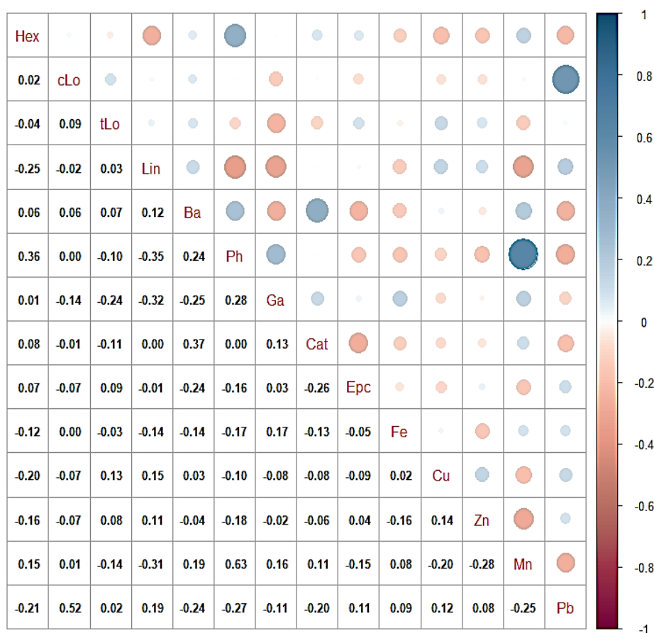
Fig. 1. Pearson correlation between studied traits of Iranian tea

of the relevant sign, as significant coefficients after Varimax rotation. Under the above conditions, 6 factors were identified and all of them explained 67.34 % of the diversity in the traits (Table 4). Under the above conditions, the first factor, which accounted for 19.254 % of the total changes, had positive factor coefficients for phenylethanol and manganese and a negative factor coefficient for linalool. The selection based on the second factor, which accounted for 12.65 % of the data changes, including the traits of benzyl alcohol, catechin and epigallocatechin, will lead to the herbs with high catechin. The third factor had large and positive coefficients for cis -linalool oxide and lead. This factor justified 10.48 % of the data changes (Table 4).