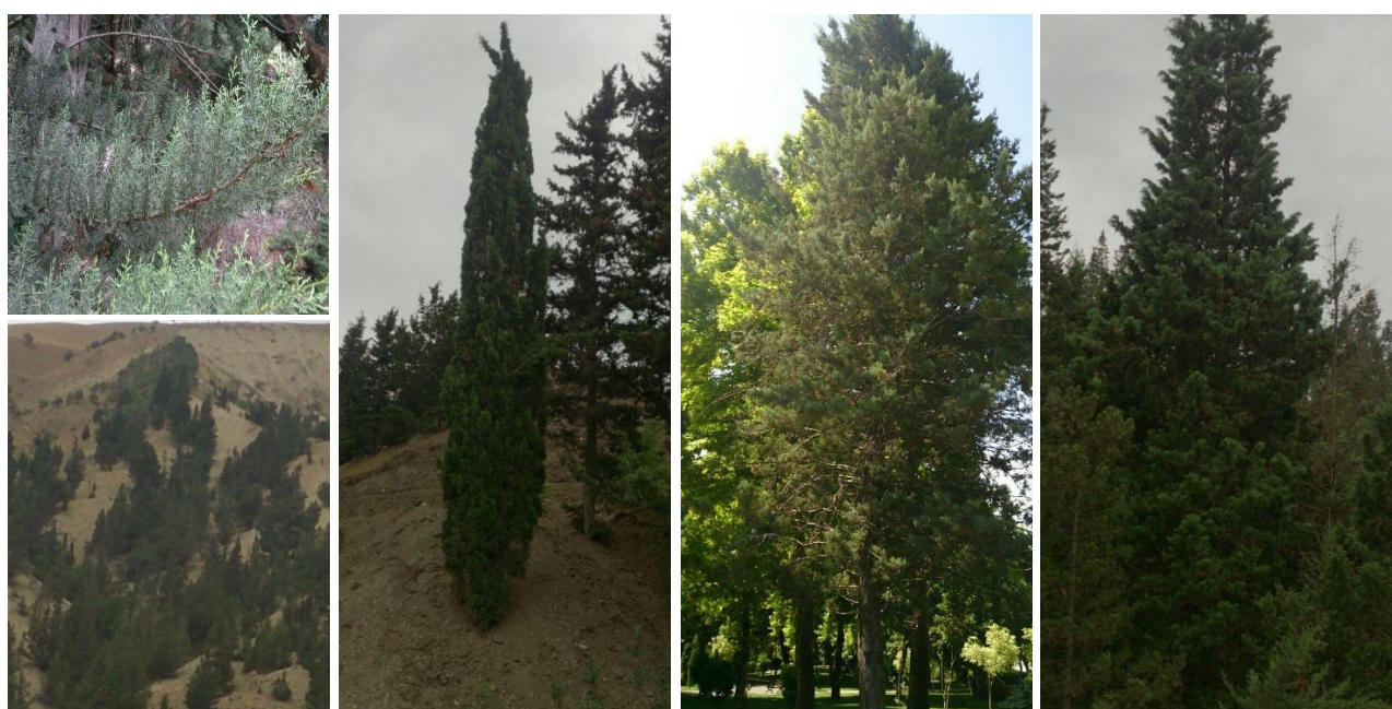
C. sempervirens var. horizontalis