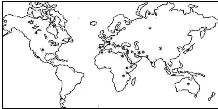
Figure 1- Fenugreek cultivation throughout the world [26]

Different authors have widely divergent opinions about the probable ancestry of T. foenum-graecum . Vavilov [27] has suggested that fenugreek is native to the Mediterranean region, while De Candolle [28] and Fazli and Hardman [2] proposed an Asian origin for the crop [26]. De Candolle [28] and Fazli and Hardman [2] notice that fenugreek grows wild in Punjab and Kashmir, in the deserts of Mesopotamia and Persia, in Asia Minor and in some countries in Southern Europe such as Greece, Italy and Spain. De Candolle [28] believes that the origin of fenugreek should be Asia rather than Southern Europe, because if a plant of fenugreek nature was indigenous in Southern Europe it would be far more common and not be missing in the insular floras of Sicily, Ischia and the Balearic Isles [15].