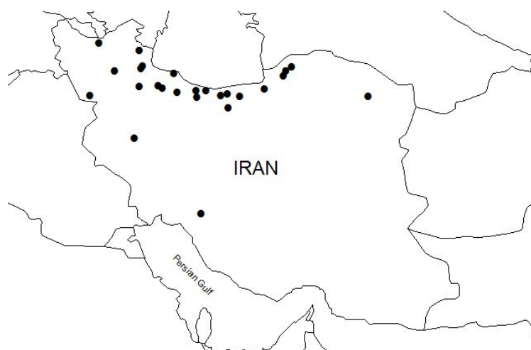
Fig. 1- The geographical origins of H. perforatum populations