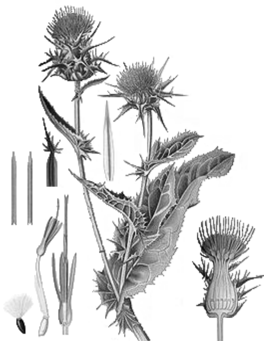
Figure 1- Milk thistle plant [30]

In general, two types of S. marianum occur in some area of Asia including purple flowers and white flowers [26]. A single capitulum can produce up to 200 florets with color ranging from magenta to purple [26]. In cut transversely, the fruit shows a narrow, brown outer area and two large, dense, white oily cotyledons [27]. Also the fruits are an