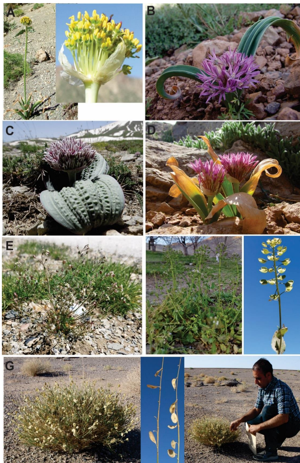
Fig. 1. Photographs of the studied plant species and their habitat and some morphological details. A) Allium chrysantherum , with a close up of the inflorescence; B) Allium alamutense ; C) Allium iranshahrii ; D) Allium zagricum ; E) Draba verna ; F) Thlaspi arvense , with details of fruiting inflorescence; G) Fortuynia garcinia , showing also details of fruits and the sampling for this study