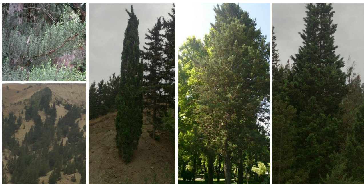
C. sempervirens var. horizontalis