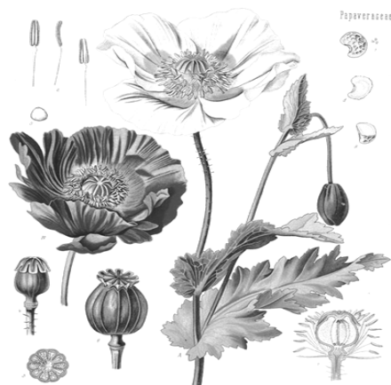
Fig. 1- Opium poppy, P. somniferum and different parts of its vegetative and generative organs [8]

Other alkaloids from poppy species have various uses: noscapine has antitussive and antitumorogenic properties; papaverine is a vasodilator and smooth muscle relaxant; sanguinarine is antimicrobial and anti-inflammatory [5, 7].